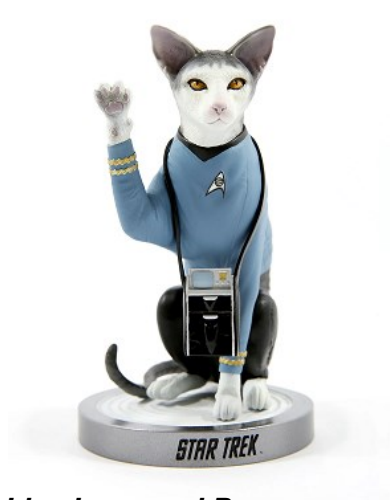
Live Long and Prospurrrrr