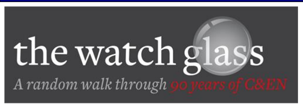
Originally published in Chemical & Engineering News, November 20, 2006